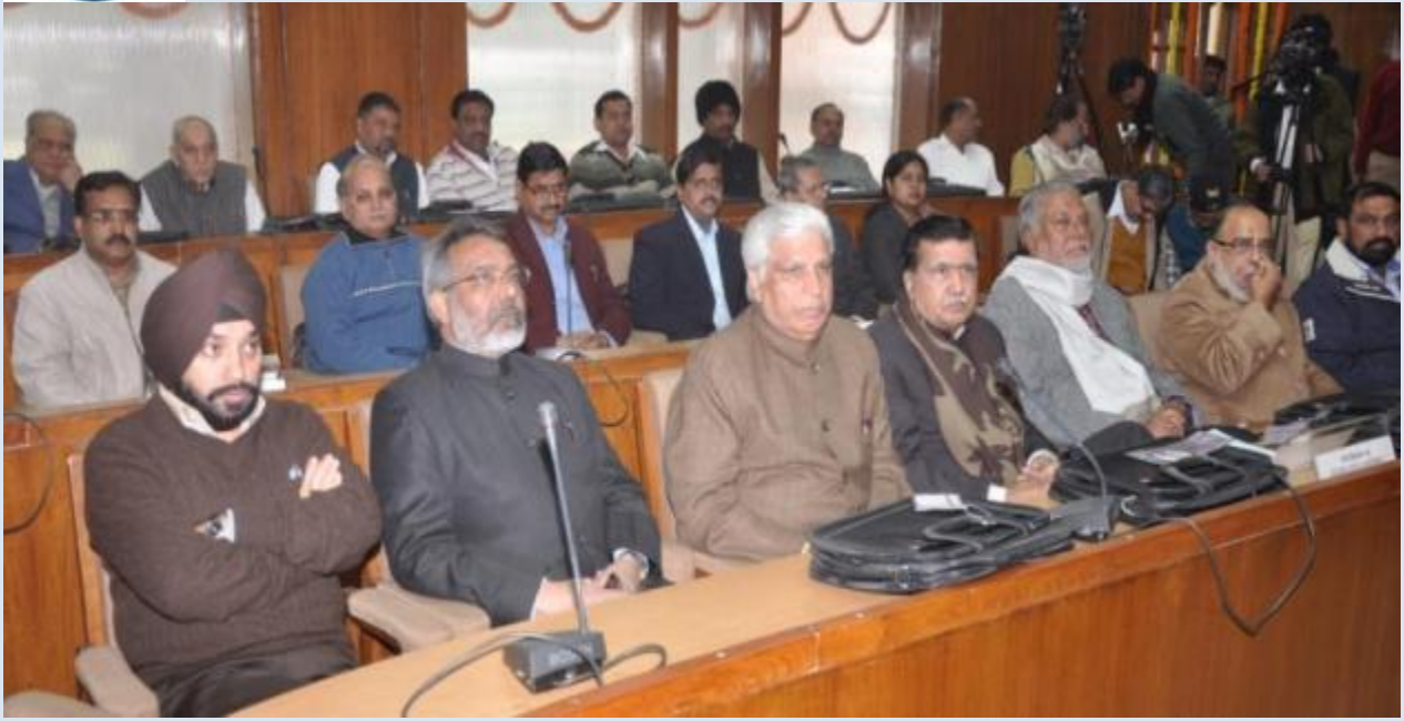
Hon'ble Members of Legislative Assembly (MLA) of Delhi Attending Workshop on Earthquake Preparedness at Delhi Vidhan Sabha