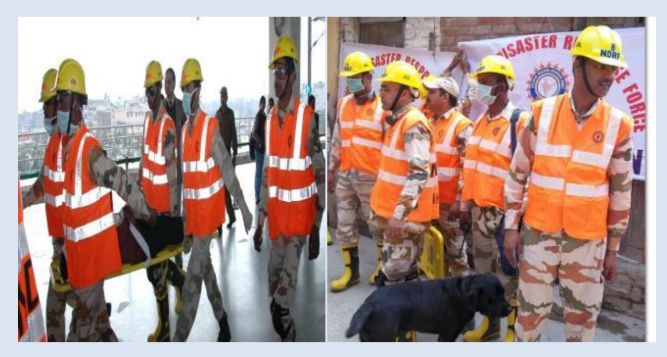
NDRF Personnel in Action during Mock Drill