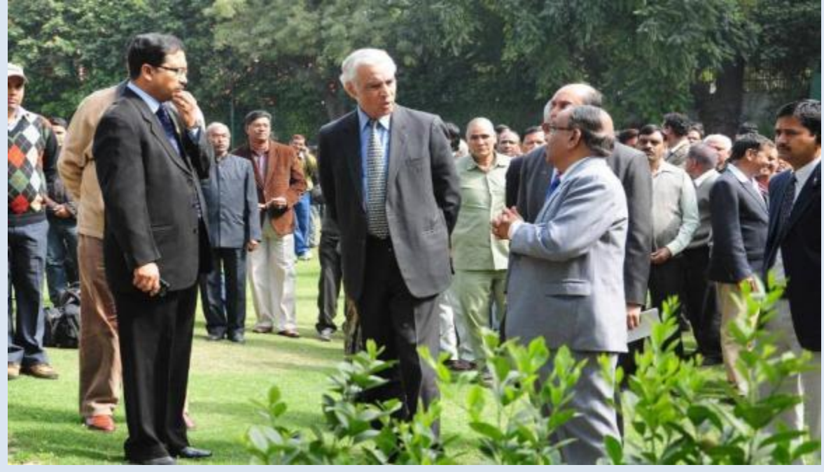
Evacuation Drill at Lt. Governor's Raj Niwas