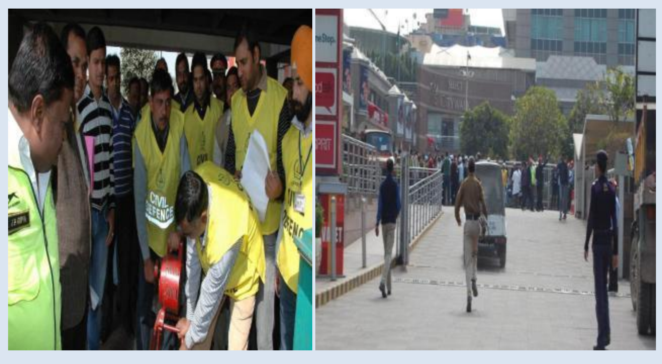
Civil and Defence Volunteers in Action