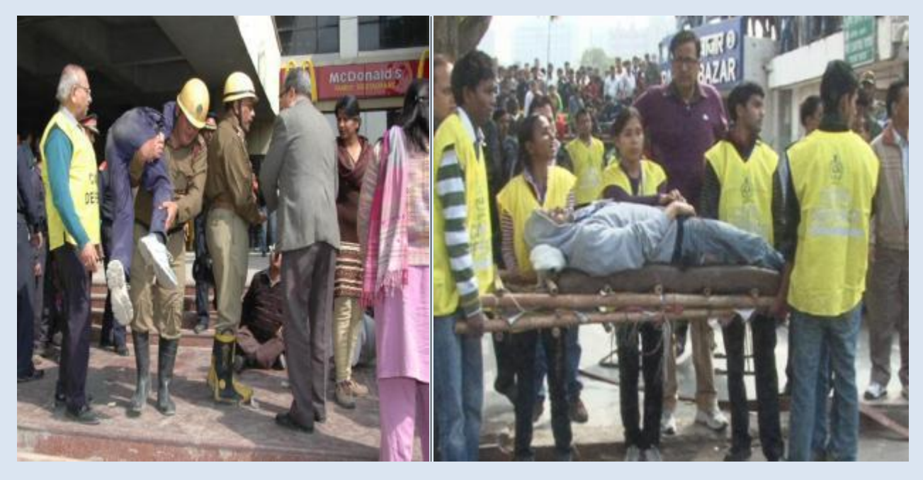
Evacuation of Casualties outside McDonald's and Palika Bazaar