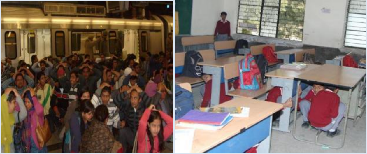
Delhi Metro Commuters during Mock Drill; School Children during Drop Cover Exercise