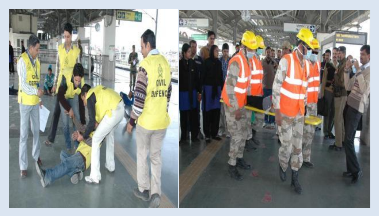
Evacuation and Rescue Operation at Metro Stations during Mock Drill

Police Evacuating Casualties outside a Cinema Hall; Volunteers Giving First Aid to Casualties