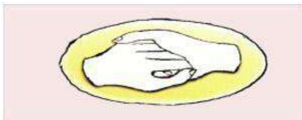
(iv) Step 4 : Wash thumbs