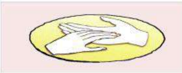
(vi) Step 6 : Wash wrists