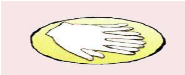
(i) Step 2 : Wash back of hands.