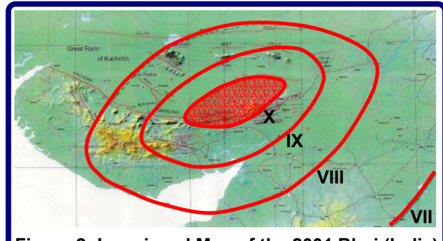
Figure 2: Isoseismal Map of the 2001 Bhuj (India) Earthquake (MSK Intensity)

The distribution of intensity at different places during an earthquake is shown graphically using isoseismals , lines joining places with equal seismic intensity (Figure 2).